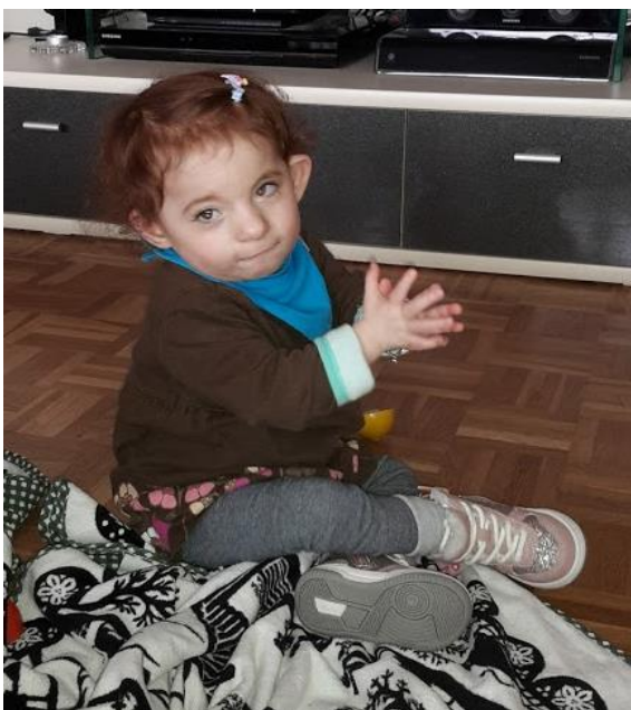
Figure 2: T. T., 22 months (with kind permission of the parents).

Because she had pneumonia with 9 months the clinic prescribed a continuous treatment with a Beta-2-stimulator. The parents come to the homeopathic case taking to better protect the child against respiratory tract infections.