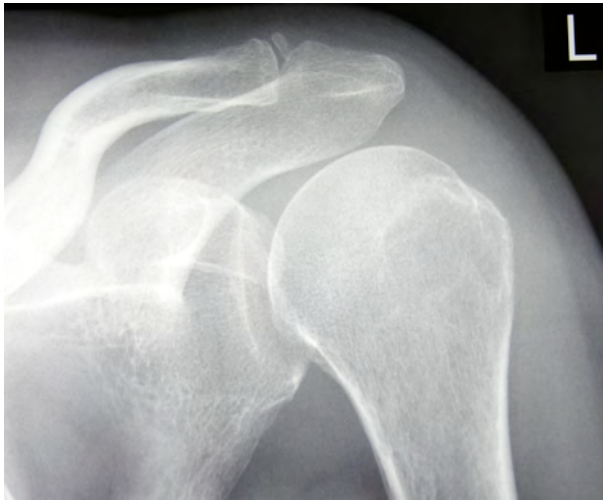
Fig. 2: Left shoulder eight months after the start of homeopathic treatment

posture for the x-ray. Ledum 500 C now produces an improvement of 50-70% for four days. Then the pains become worse again. Ledum 1000 C improves the pains by 70-80% for 10 days. She can now fully raise her arm and is pain-free for periods. Due to the short duration of action for the single doses, we decide to change to daily doses of liquid Ledum Q3 . A month later Ms K. only has pain with specific movements: she rates the improvement as 80%. We continue with increasing doses of Ledum in Q potencies . Three months after the start of treatment, she is fully pain-free and can move her left shoulder almost normally. Eight months after the start of treatment, her symptoms have completely disappeared. The current x-ray shows the following finding (fig. 2).