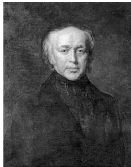
Fig. 3 Clemens von Boenninghausen (1785–1864).

A polarity difference of 0 or less (i.e. negative values) indicates remedies, which cov-